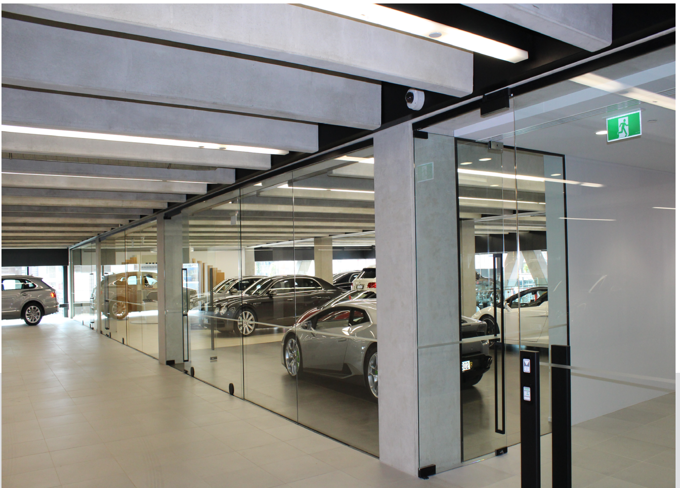
Giltrap Prestige Building, 119 Gt North Road AUCKLAND

HTTPS://WWW.THERMOSASH.CO.NZ/DOWNLOADS-RESOURCES/BPIR-DOCUMENTS/