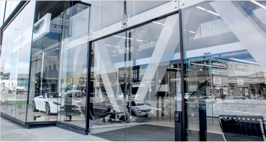
Giltrap Prestige, Auckland - channel glazed showroom with integrated glass fins and framed glass auto doors