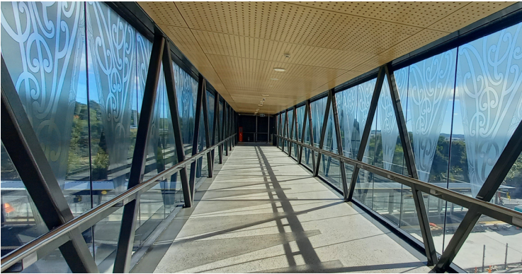
Constellation Bus Station, Auckland - channel glazed pedestrian overpass