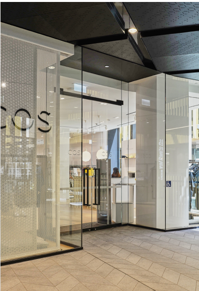
Commercial Bay AUCKLAND CBD

We exclusively use local powder coaters who have stringent chemical handling processes and reuse or responsibly dispose of all waste powder.