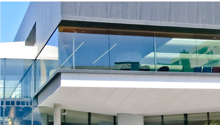
Victoria University Wellington, The Hub, Kelburn Campus - channel glazing to upper level