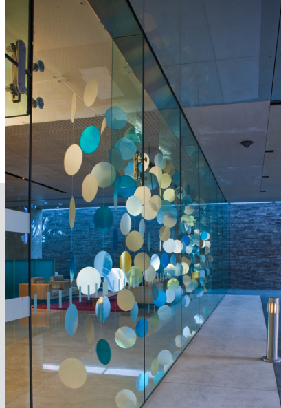
Lumley Tower AUCKLAND CBD