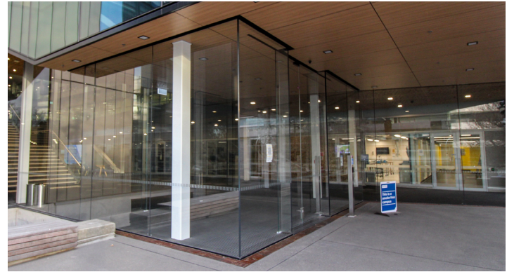
UOA Engineering 405 - channel glazed entrance with frameless glass doors