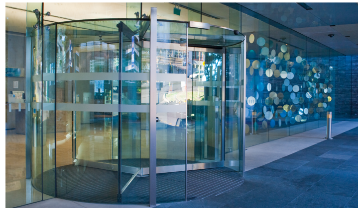
Lumley Tower, Auckland - channel glazed entrance incorporating revolving door