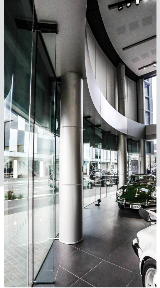
Medcar Porsche, Christchurch - showroom with recessed channel glazing and integrated glass fins