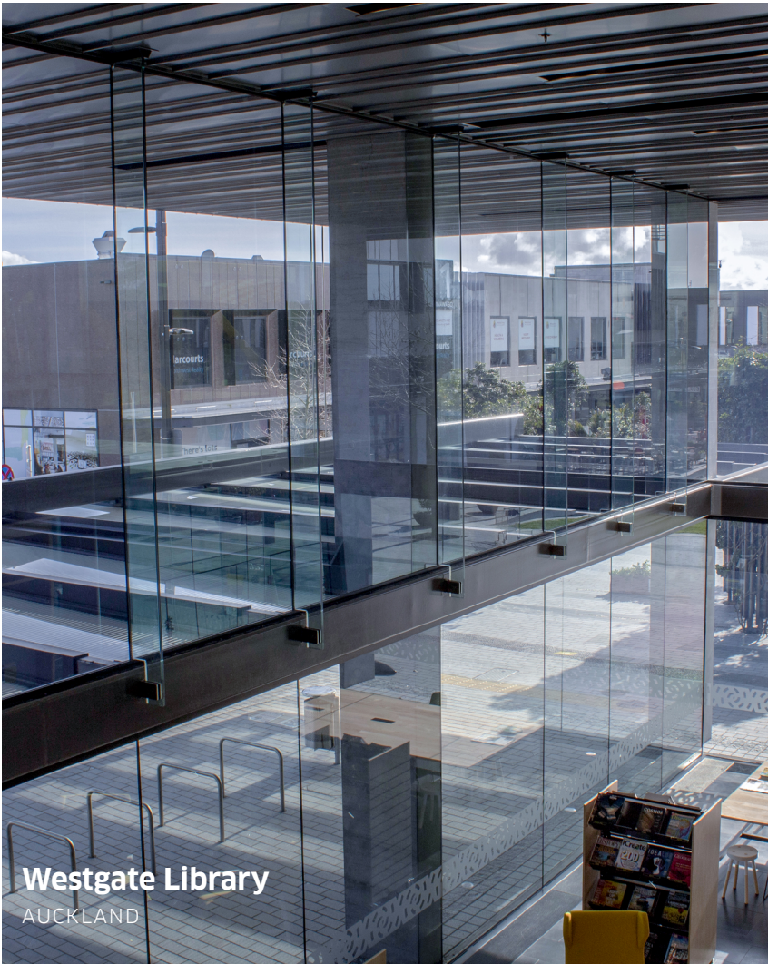
Westgate Library AUCKLAND