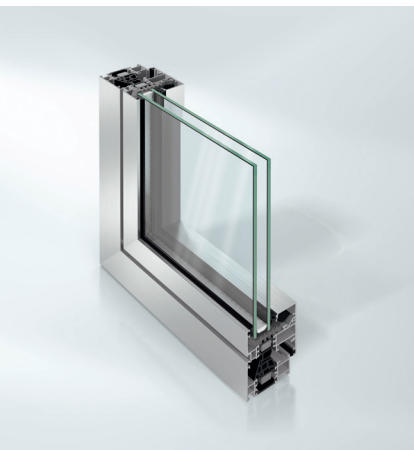
Schüco window AWS 65.HI+