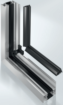
Schüco window AWS 65 circumferential centre seal, exploded view