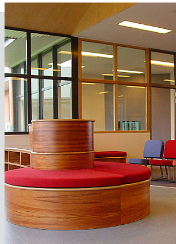
Youth Justice, Christchurch - windows installed with specialist security glass.