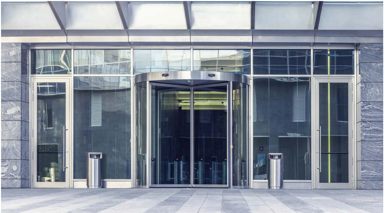
SÄLZER security doors can integrate automated fittings, access control units and escape door technology.