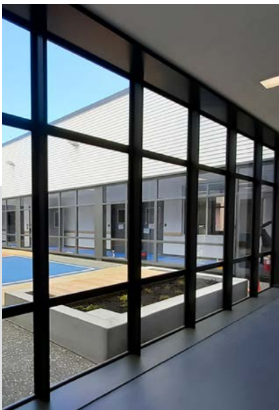
Mason Clinic WDHB AUCKLAND

We exclusively use local powder coaters who have stringent chemical handling processes and reuse or responsibly dispose of all waste powder.