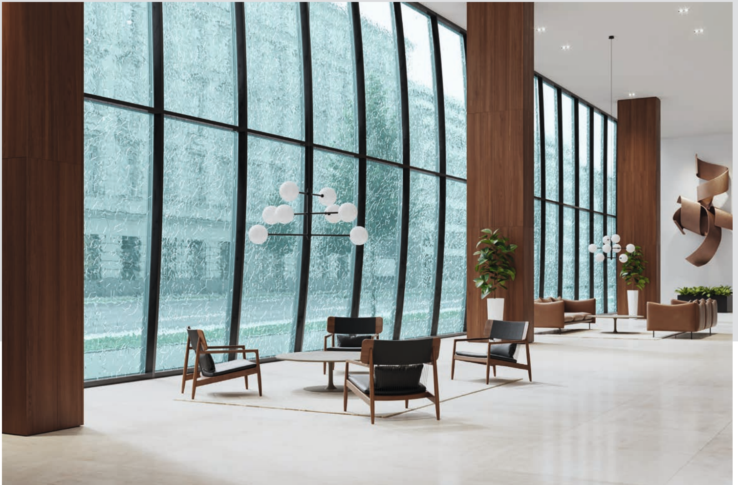
SÄLZER high performance security facades offer design elegance with blast resistant protection. The system allows for insert windows (inward or outward opening, tilt turn, bottom hung casement), hinged or sliding doors, security skylights and security access systems.