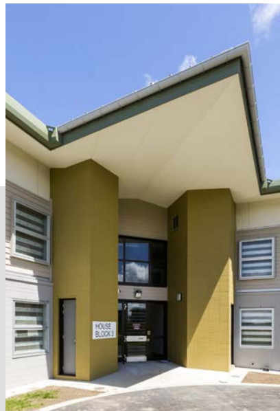
Wiri Prison AUCKLAND