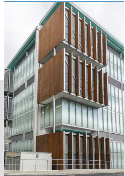
Mt Eden Correctional Facility AUCKLAND