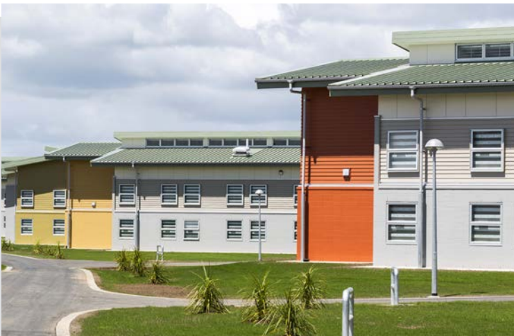
Wiri Prison, Auckland - security windows with bespoke sash.