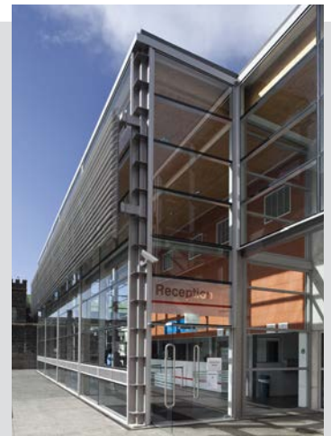
Mt Eden Prison gate house, Auckland - security glass facade