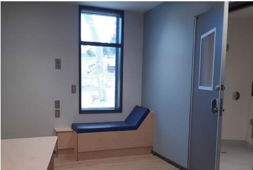
Mason Clinic E Tui Tanekaha, Auckland (for mentally disabled offenders) - the windows provide security and offer a domestic aesthetic to the building.