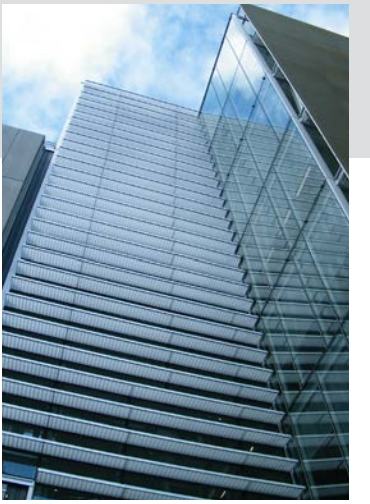
Shadetread™ externally integrated in PW1000 flush glazed curtainwall and Shadegrate™ as internal balustrades - Telecom Tower, Willis St, Wellington