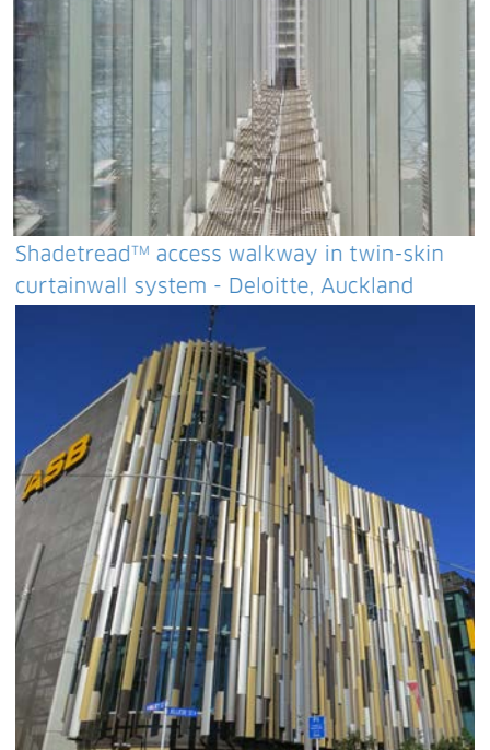
Shadetread™ external facade service access behind vertical sunshade elements and integrated into PW1000 Unitised Curtainwall - ASB North Wharf, Auckland