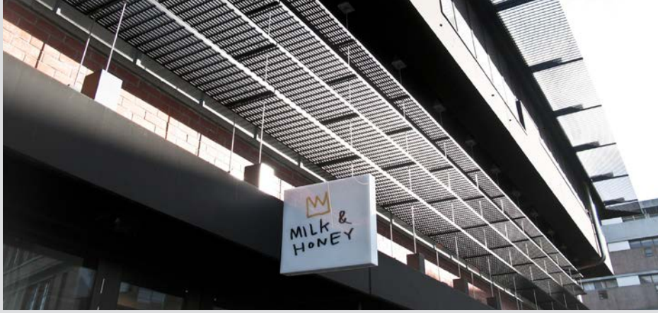
Shadetread™ installed to facade as external trafficable sunscreens - Victoria University, The Hub, Kelburn Campus