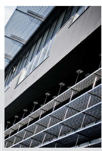
VUW- The Hub WELLINGTON