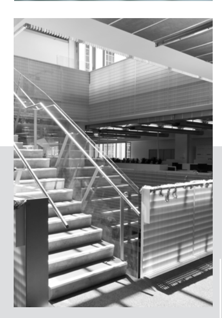
Telecom Tower WILLIS STREET, WELLINGTON

We exclusively use local powder coaters who have stringent chemical handling processes and reuse or responsibly dispose of all waste powder.