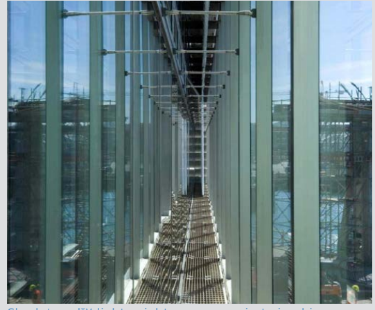
Shadetread™ lightweight accessway in twin-skin curtainwall system - Meridian Energy HQ, Wellington