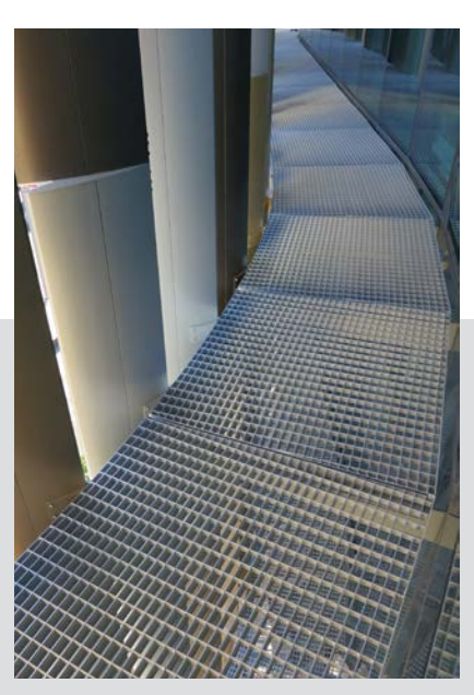
ASB North Wharf AUCKLAND