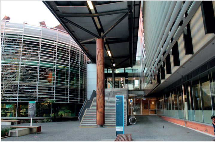
Waitakere Civic Centre, Auckland - PW400 Unitised Curtainwall installed as secondary glazing to Civic building and primary curtainwall to Admin block.