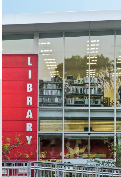
Karori Library WELLINGTON