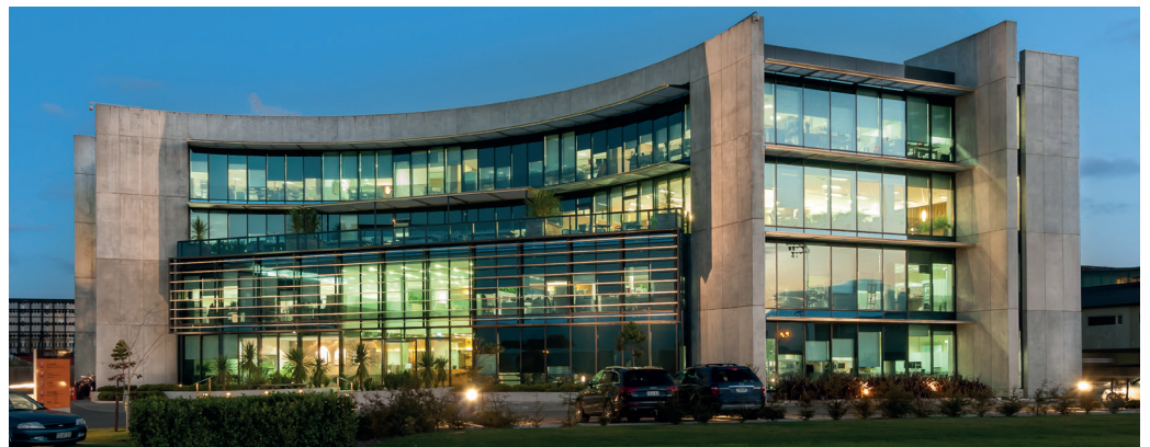
Showplace, Christchurch - PW400 Unitised Curtainwall with integrated solar shading