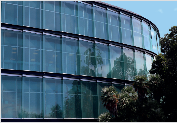
UOA Thomas Building - PW400 Unitised double glazed curtainwall with external skin structural glass louvres