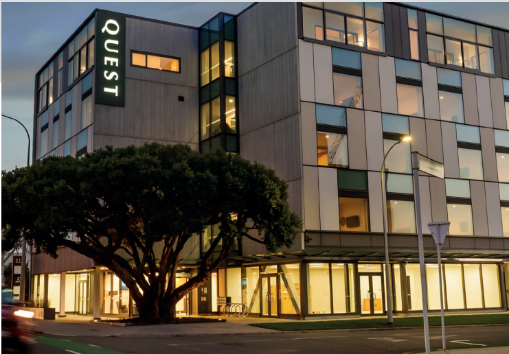
Quest Hotel, Takapuna - PW400 Unitised Curtainwall Suite to the ground floor