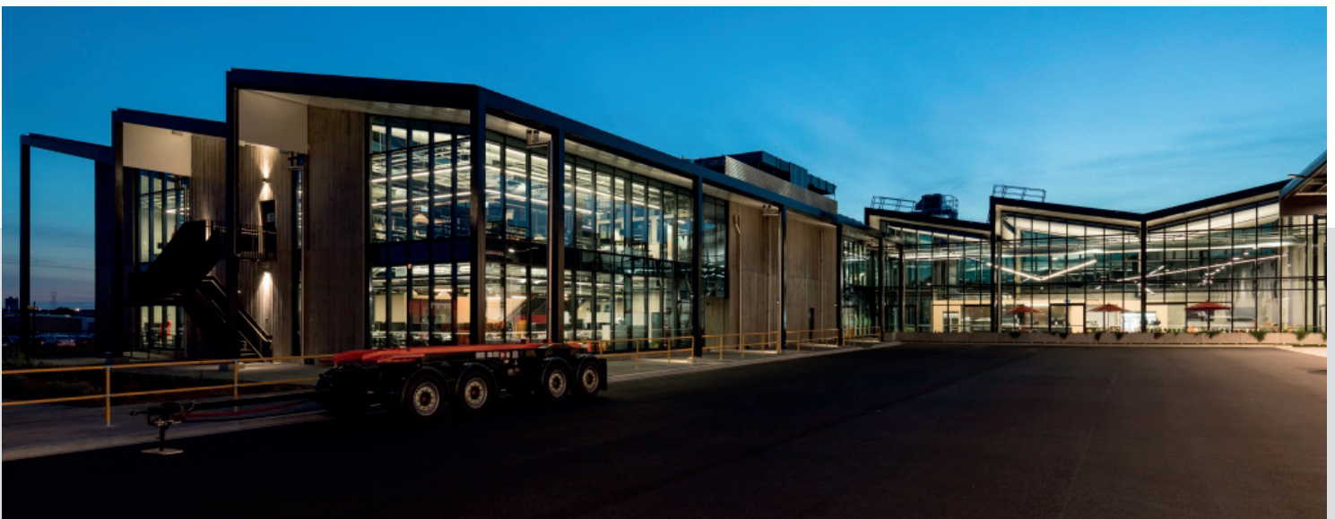
Waste Management NZ, Auckland - PW400 Curtainwall

NOTE: THIS BROCHURE CONTAINS A SUMMARISED VERSION OF BUILDING PRODUCT INFORMATION REQUIREMENTS (BPIR) CLASS 2 DISCLOSURE INFORMATION - OUR COMPREHENSIVE DOCUMENTS CAN BE DOWNLOADED FROM: HTTPS://WWW.THERMOSASH.CO.NZ/DOWNLOADS-RESOURCES/BPIR-DOCUMENTS/