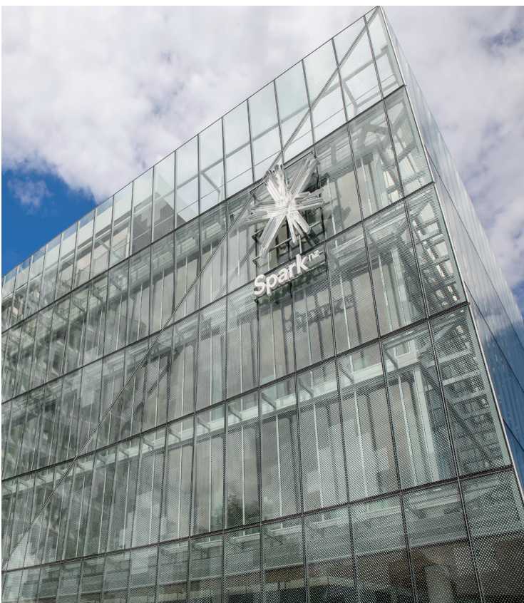
Spark HQ, Christchurch - internal PW400 skin with an external PW1000 skin