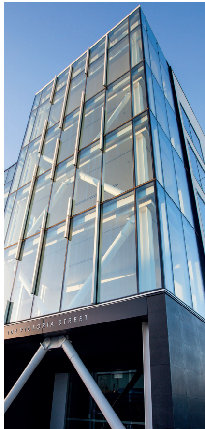
104 Victoria Str, Christchurch - PW400 Unitised Curtainwall with integrated vertical fins