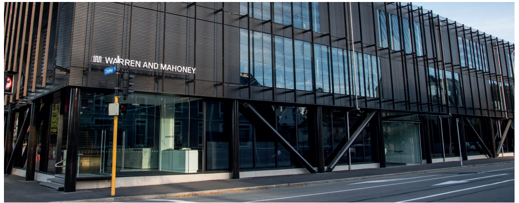
Warren and Mahoney Offices, Christchurch - PW400 Unitised Curtainwall with channel glazing & opening sashes to ground floor