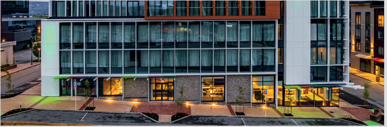
Holiday Inn Remarkables Park, Queenstown - PW400 Unitised Curtainwall Suite to the ground floor