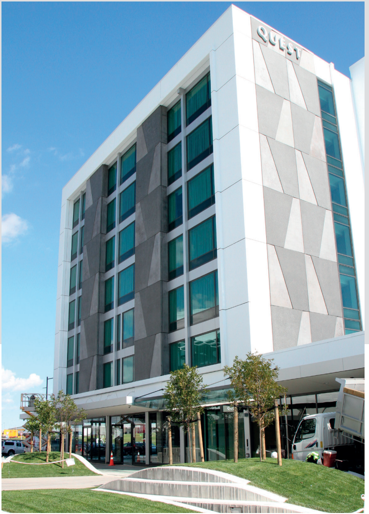
The Crossing, Quest Hotel, Auckland - PW400 Unitised Curtainwall