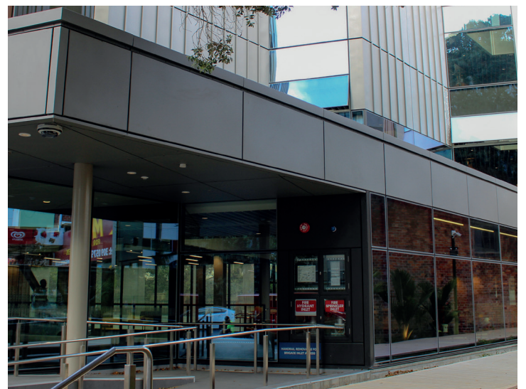
UOA Parkwest 507 - PW400 Suite to wind lobbies