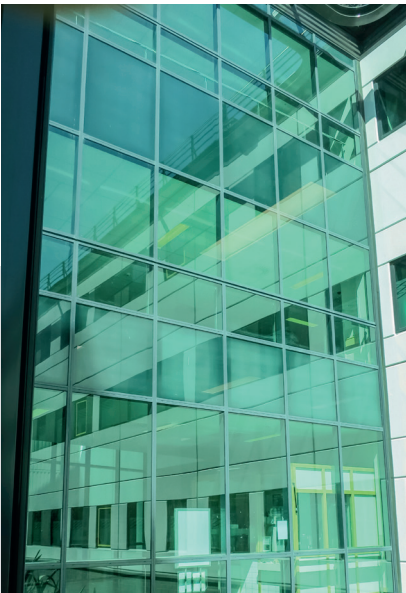
Middlemore Hospital AUCKLAND

We exclusively use local powder coaters who have stringent chemical handling processes and reuse or responsibly dispose of all waste powder.