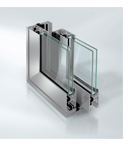
Schüco Sliding System ASS 50

The ASS 50 thermally insulated sliding and lift-and-slide system connects the outstanding qualities of a robust vent frame with a narrow face width for room flooded with light. The fully concealed Schüco e-slide drive system (optional) opens, closes and locks even floor-to-ceiling units easily and safely at the touch of a button.