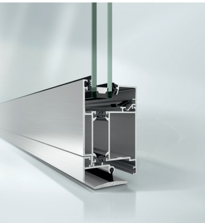
Schüco door ADS 65 HD Sandwich

The Schüco Door ADS 65 HD (Heavy Duty), also available as oversize units for large architectural projects, creates a striking feature of the facade with its slim face width. It has a particularly robust design and offers large opening widths for busy buildings. The basic depth of 65mm and the clearance height of up to 3000mm allow a wide range of applications and design options. This classic, timeless design perfectly co-ordinates with the Schüco facade and window systems for an outstanding combination.