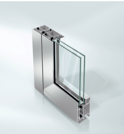
Schüco door ADS 65 HD Corner