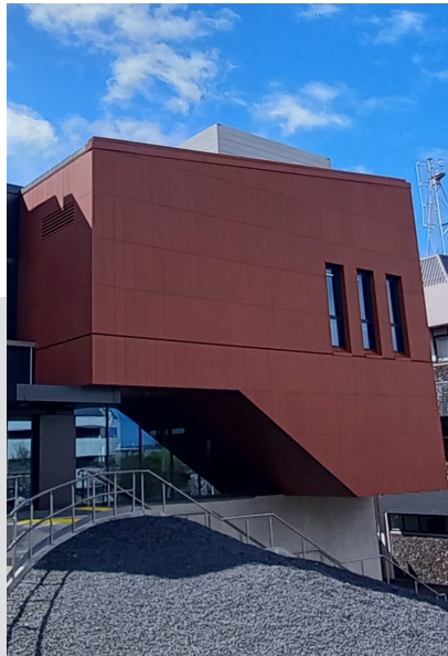
OTAGO POLYTECHNIC TTB DUNEDIN