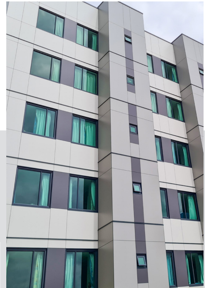
MIDDLEMORE HOSPITAL AUCKLAND