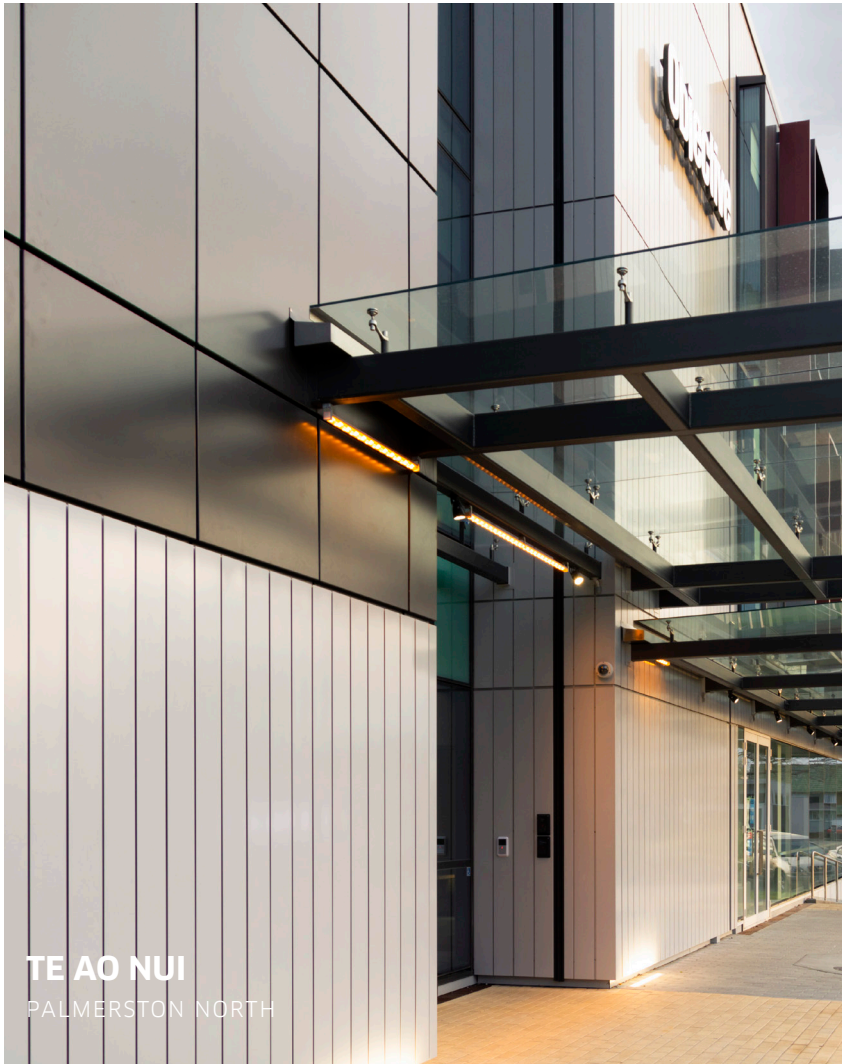
TE AO NUI PALMERSTON NORTH