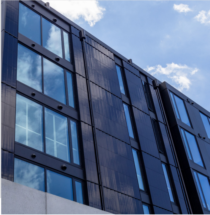
One St Stephens, Auckland - black Terracotta tile cladding vertically installed with ENCLAD™ EN03 Rainscreen Support System.