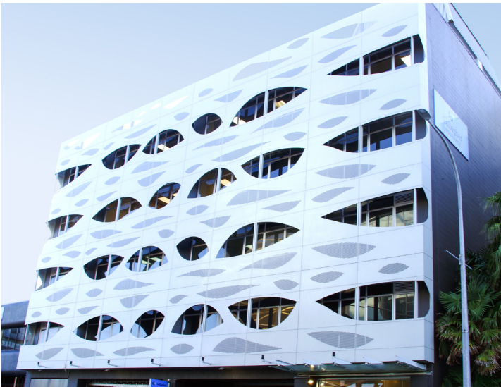
15 Huron St, Auckland - laser cut aluminium cladding installed with ENCLAD™ EN05-FF Support System.