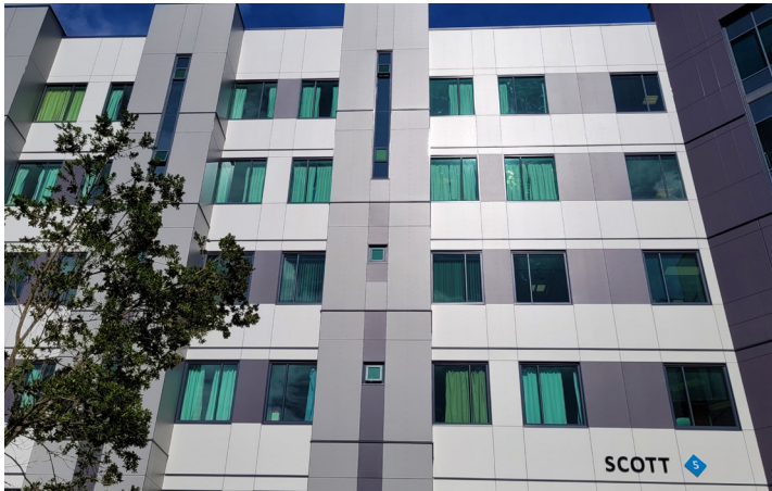
Middlemore Hospital, recladding of Scott building, Auckland - FUNDERMAX high pressure laminate installed with ENCLAD™ EN01 Support System.