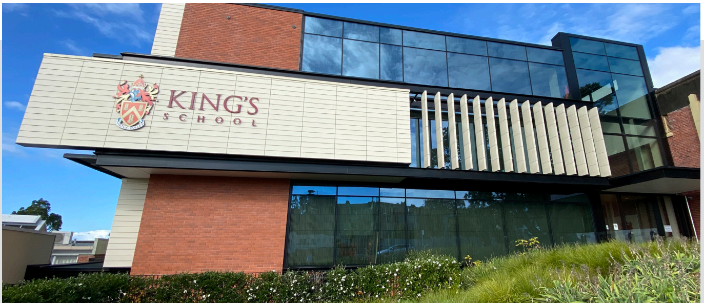
King's School, Auckland - Terracotta tiles horizontally installed with ENCLAD™ EN02 Rainscreen Support System.

NOTE: THIS BROCHURE CONTAINS A SUMMARISED VERSION OF BUILDING PRODUCT INFORMATION REQUIREMENTS (BPIR) CLASS 2 DISCLOSURE INFORMATION - OUR COMPREHENSIVE DOCUMENTS CAN BE DOWNLOADED FROM: HTTPS://WWW.THERMOSASH.CO.NZ/DOWNLOADS-RESOURCES/BPIR-DOCUMENTS/