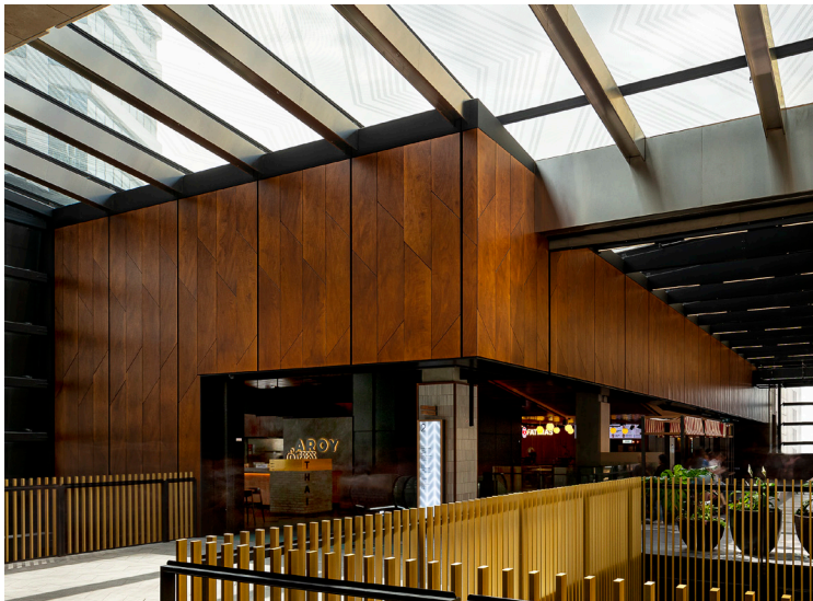
Commercial Bay, Auckland - interior PRODEMA High Pressure Laminate installed with ENCLAD™ EN01 Support System.