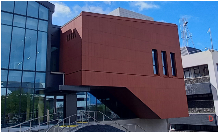
Otago Polytechnic Trades Training Building, Dunedin - Terracotta tile cladding vertically installed with ENCLAD™ EN03 Rainscreen Support System.