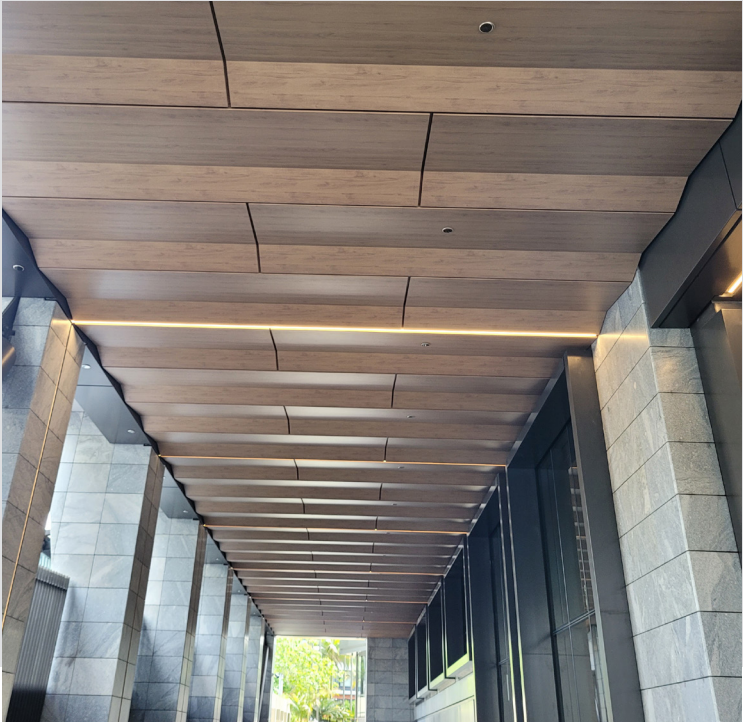
Cordis Hotel, Auckland - sublimated woodgrain aluminium soffits installed with ENCLAD™ EN01 Support System