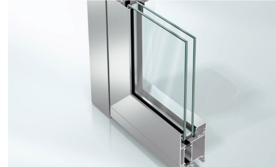
Schüco ADS 65 HD

The Schüco ADS 65 HD (Heavy Duty), also available as oversize units for large architectural projects, creates a striking feature with its slim face width. It has particularly robust design and offers large opening widths for busy buildings. The basic depth of 65mm and the clearance height of up to 3000mm allow a wide range of applications and design options. This design perfectly co-ordinates with the Schüco window systems for an outstanding combination.