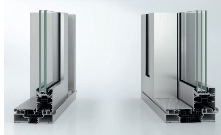
Schüco ASE 60/80

The fittings system, which is also modular, can be used as both sliding and lift-and-slide fittings, with a few exceptions. Narrow face widths and the option of level thresholds make the Schüco sliding system unique in terms of form, design and user comfort.