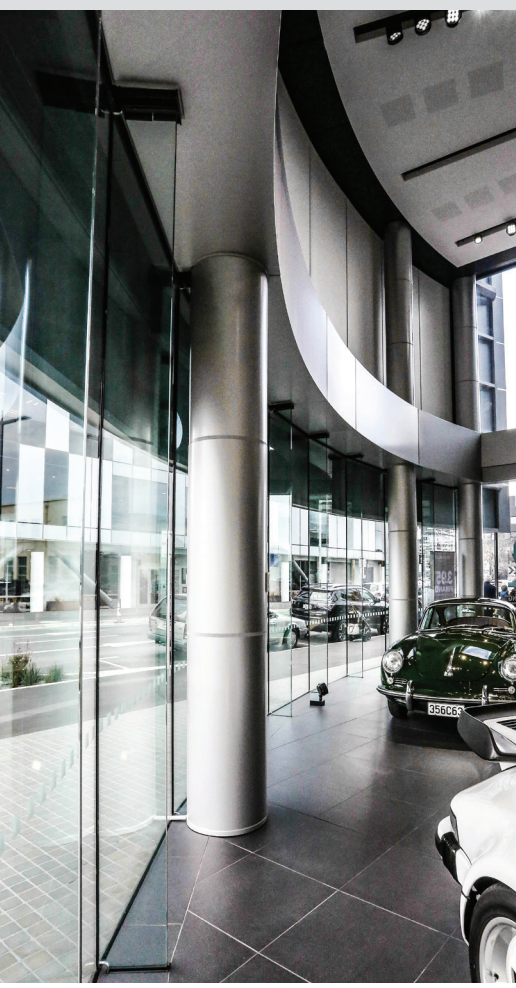
Medcar Porche, Christchurch - showroom with recessed channel glazing and integrated glass fins