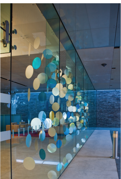
Lumley Tower AUCKLAND CBD