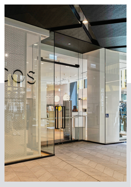
Commercial Bay AUCKLAND CBD

We exclusively use local powder coaters who have stringent chemical handling processes and reuse or responsibly dispose of all waste powder.