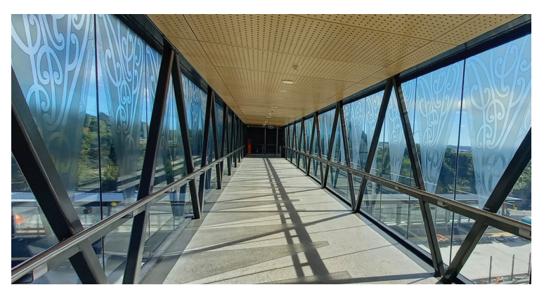
Constellation Bus Station, Auckland - channel glazed pedestrian overpass