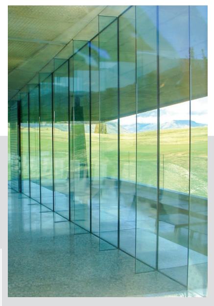
Boxer Hills Club ARROWTOWN