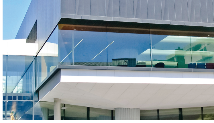
Victoria University Wellington, The Hub, Kelburn Campus - channel glazing to upper level